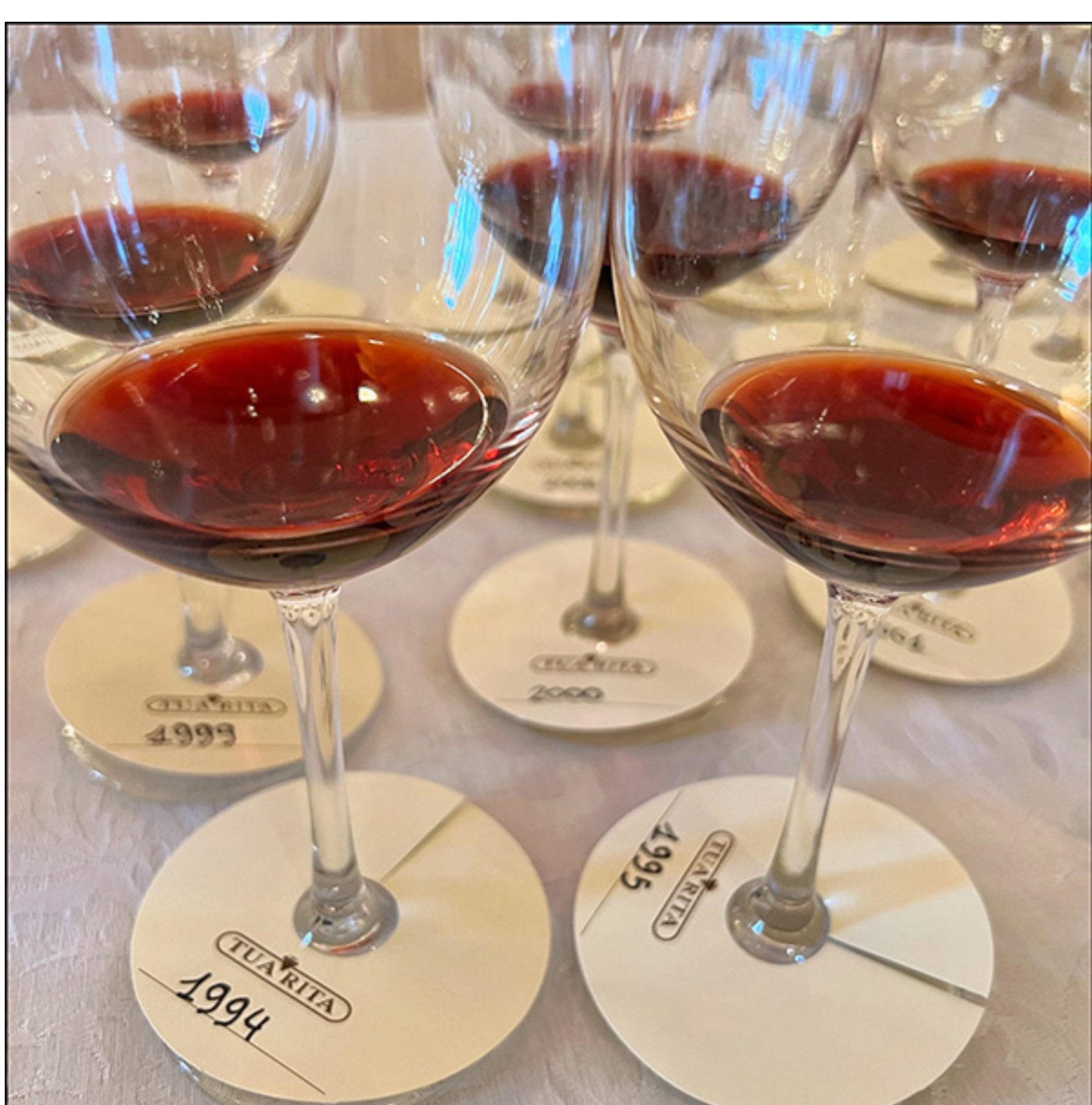
1994 is the first vintage of this iconic Tuscan Merlot.

They recognized potential and opportunity in an area far away from the headline appellations of Tuscany in an area not previously associated with fine wine.