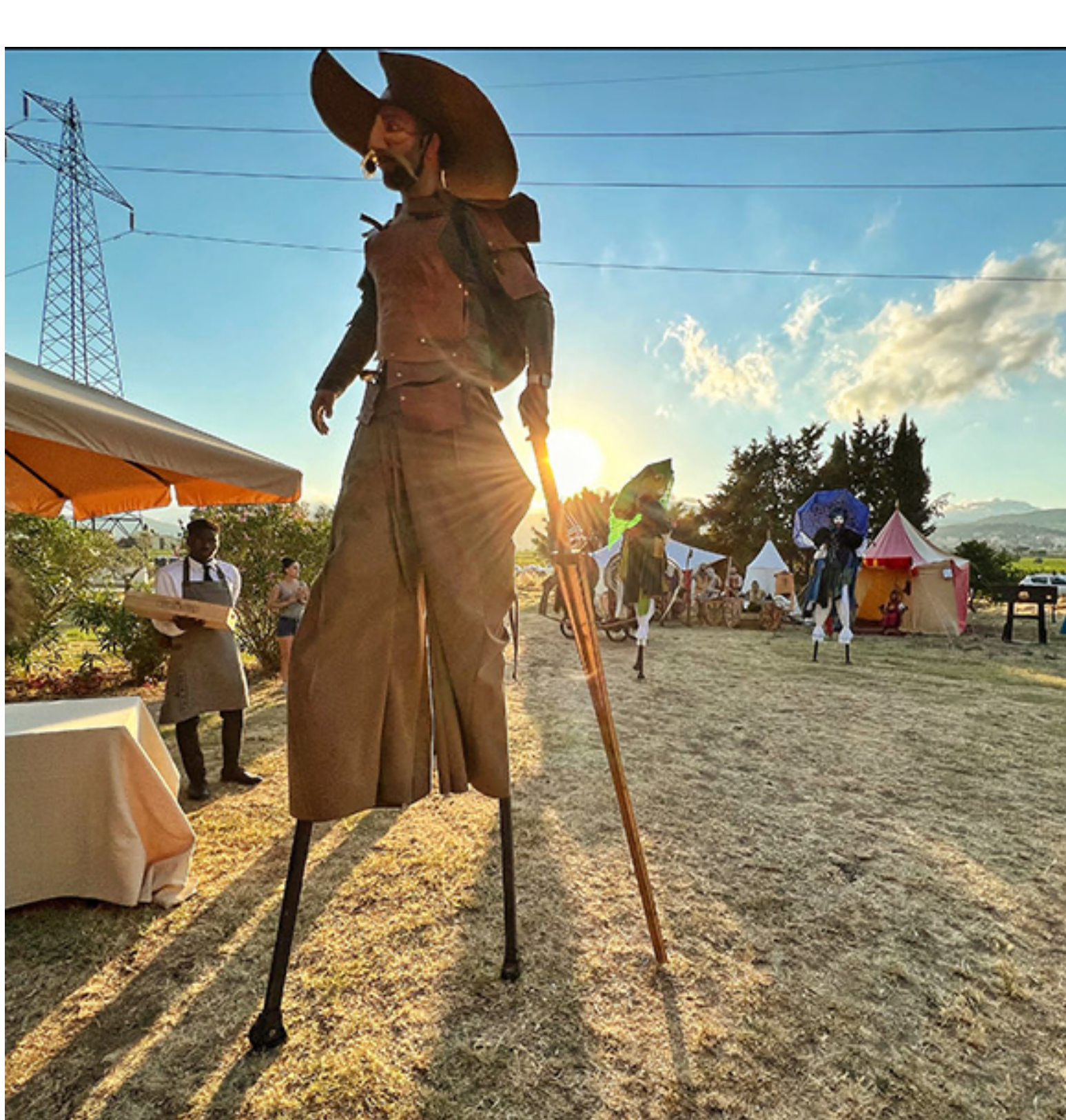
At the end of the tasting, guests enjoyed a medieval-themed show.

A personal sweetheart vintage is 2014, which is showing exceptionally well right now thanks to its subtle and delicate approach. That was an underdog year with lots of rain and cooler temperatures. The most recent vintages 2015, 2016, 2018 and 2019 are all phenomenal.